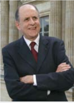
JEAN-MARC SAUVÉ Vice-president

The Council of State is chaired by the Vice-President. Such title goes back to the ancient times, when the Council was chaired by the Head of State or other government officials.