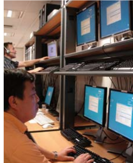
A modern information technology system to manage cases in the Council, courts of appeal and tribunals.