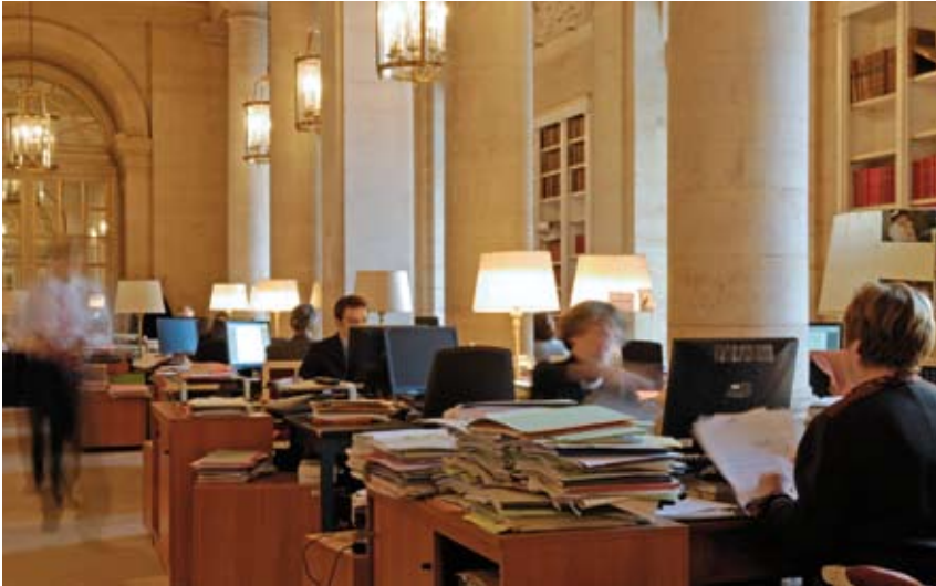
Members at work in the Parodi Hall.