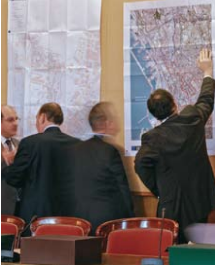
A session of the Public works section bringing together members of the Council of State and representatives of the government.