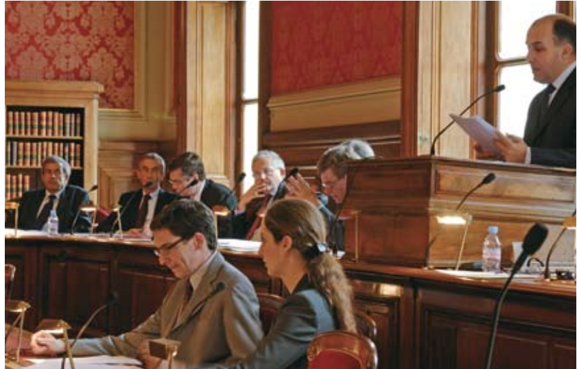
The Litigation section in judgment formation – cases are heard that represent a particular difficulty from a legal standpoint.