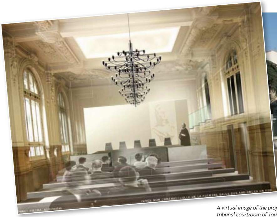
A virtual image of the projected administrative tribunal courtroom of Toulon.